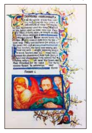
Figure 4. Sonnet VI 'Supreme Surrender' from The House of Life by D.G. Rossetti. Illuminated manuscript by Phoebe Anna Traquair (National Library of Scotland).