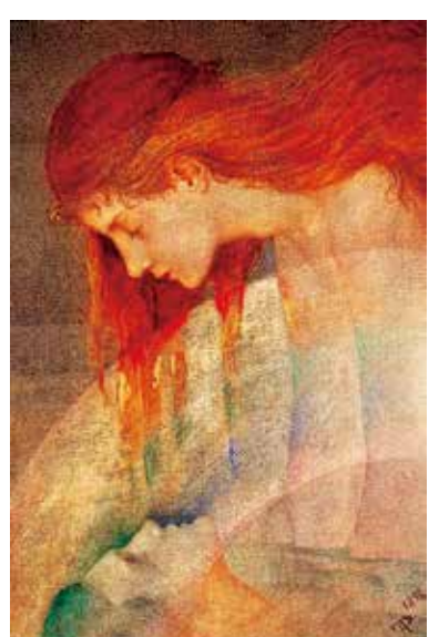
Figure 6. Love's Testament (1898), oil canvas by Phoebe Anna Traquair.